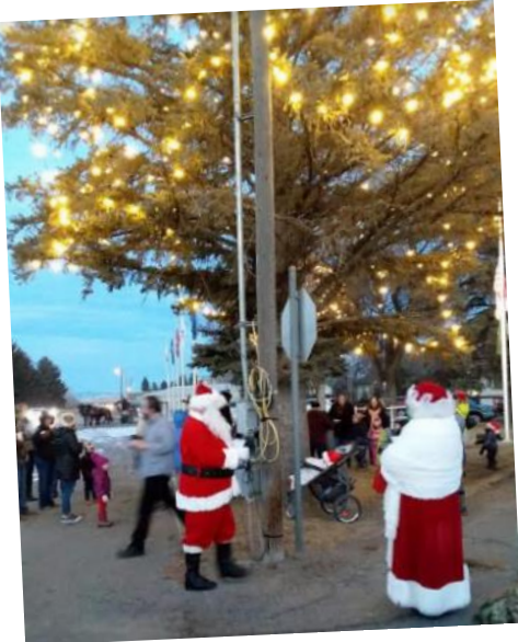
2018 Christmas Stroll Highlights